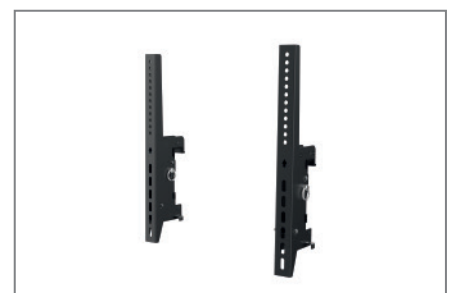
VESA max. 600 x 400 mm