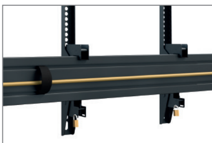
Cable management by cable clips