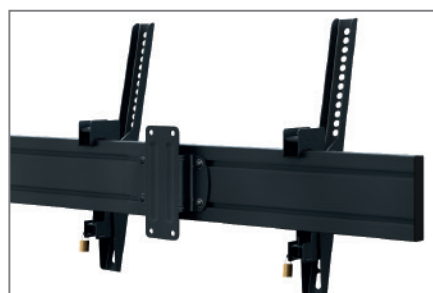
Adaptable thanks to modular design